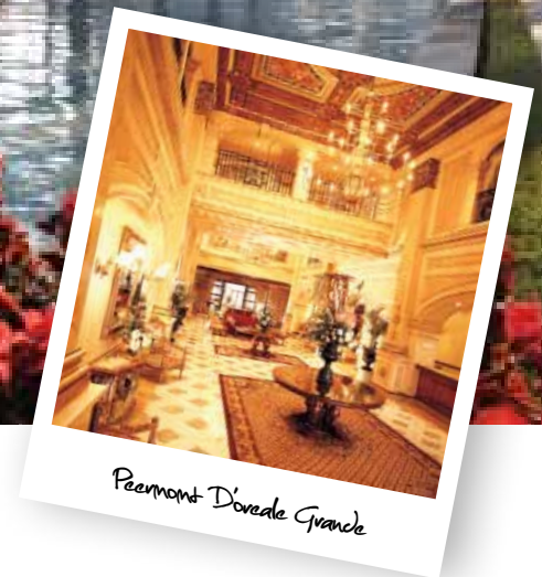
Peermont D'oreale Grande

TATLER OFFER Africa Travel can arrange an overnight stay at Peermont D'oreale Grande from £95 per person, Peermont Mondior from £70 per person and Peermont Metcourt from £60 per person. To book, call 020 7843 3580 or visit africatravel.co.uk/tatlertravel .