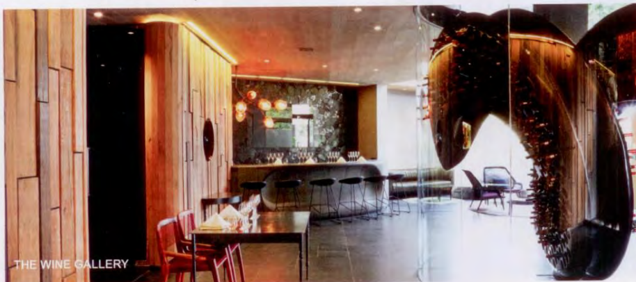
THE WINE GALLERY