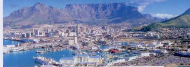
TABLE BAY HOTEL

Want a holiday with a difference? Africa Travel offers a seven-night holiday from £2,395 per person sharing, including three nights at the Table Bay Hotel, two nights at the Royal Livingstone Hotel and two nights at the Palace of the Lost City, plus breakfasts, airport transfers and flights from London Heathrow with South African Airways.